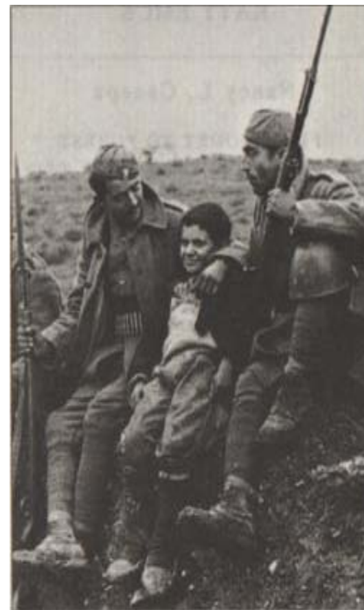
Greek soldiers in Albania with an Albanian boy, 1914

Fischer paints a picture of confused Italian occupiers, who were ill-equipped to cope with the formidable geographical and logistical problems of policing Albania. They do not seem to have clearly understood that, under King Zog, there was barely a functional state. But the Germans were well informed about Albanian political culture and history. The British, on the other hand, with the exception of anthropologists, suffered from domination of pre-World War II